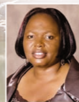
Linkie Mohlala Executive Mayor

Towns which fall under Emakhazeni include Emakhazeni (Belfast), Dullstroom, Entokozweni (Machadodorp) and Emgwenya (Waterval Boven). Belfast is the main gateway to the picturesque Highlands Meander and is situated 2000m above sea level and the warm Lowveld areas. Renowned for its surrounding breathtaking scenery and unique flora & fauna, it imbues a sense of relaxation and rejuvenation.